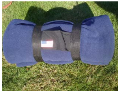
Blanket with carry handle