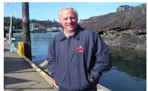
Micro-Fiber, Lightweight Jacket