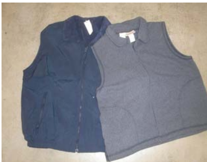
Vest with Fleece Lining