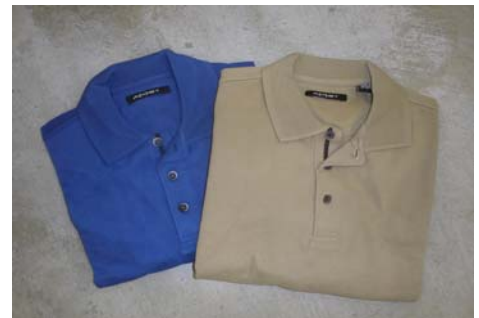
Polo Shirts, Blue or Tan