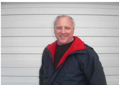
Mountain Tex Fleece Jacket